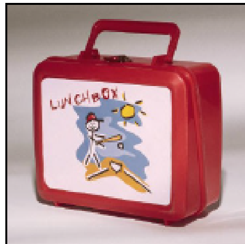
Behold the simple lunchbox—an outlet for creativity on its outside ... and inside.

For more information and lunch ideas, please visit the Alberta Health Services website at www.albertahealthservices.ca .