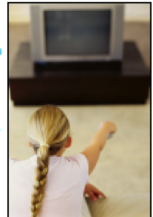
Teaching your children how to be media wise helps them understand the plethora of messages they receive from advertisers and other programming on television.

what it would be like to use their product? Why or why not?